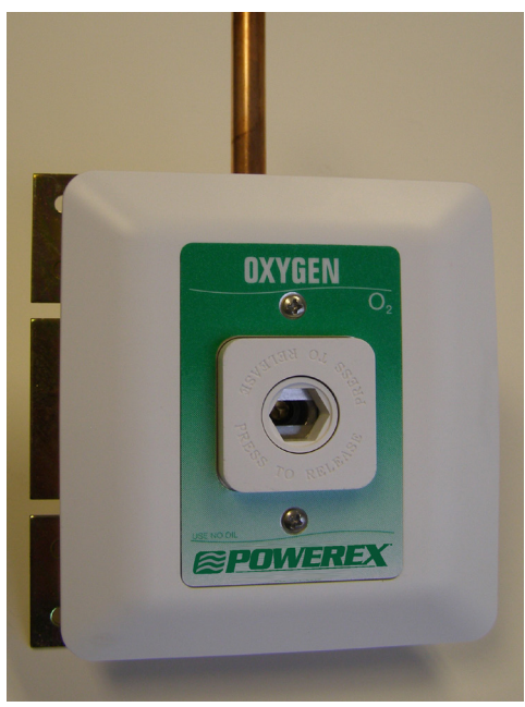
Part Number PX-XP1124 shown

The outlet nameplate shall be permanently color coded with a durable, scratch resistant and protective label. The outlet trim plate shall be durable plastic, attached with the nameplate to the rough-in assembly, and provide automatic plaster adjustment from \frac{1}{2} to \frac{1}{4} of an inch (1.3 cm to 3 cm). The name of the gas service shall be permanently marked on the outlet bracket and the outlet. The outlet's rough-in supply tube shall be a 7 inch (18 cm) length of