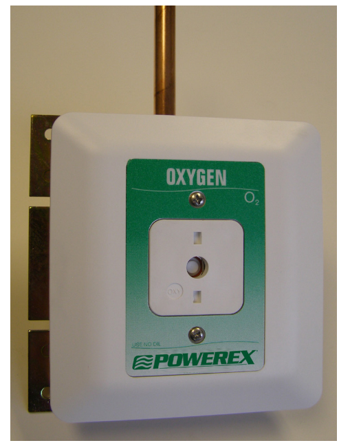
Part Number PX-XQ1124 shown

The outlet nameplate shall be permanently color coded with a durable, scratch resistant and protective label. The outlet trim plate shall be durable plastic, attached with the nameplate to the rough-in assembly, and provide automatic plaster adjustment from ½ to 1 ¼ of an inch (1.3 cm to 3 cm). The name of the gas service shall be permanently marked on the outlet bracket and the outlet. The outlet's rough-in supply tube shall be a 7 inch (18 cm) length of ½ OD copper Type K for all gas services and labeled with