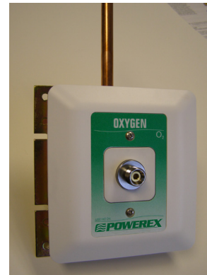
Part Number PX-XF1124A shown

The medical gas outlets shall be designed so that, once installed, routine service of both the primary and secondary check valves can be accomplished without removing the nameplate or gas specific portions. The primary check valve shall be unitized and of the cartridge type. To allow the primary check valve to be removed for service without shutting off the gas supply to the outlet, the secondary check valve shall operate automatically to stop the free flow of the positive pressure gas. There shall be no secondary check for vacuum or WAGD services. Medical gas outlets which require the removal of the nameplate or gas specific components for routine service shall not be acceptable.